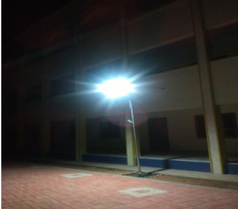
Solar Lighting system - Working condition