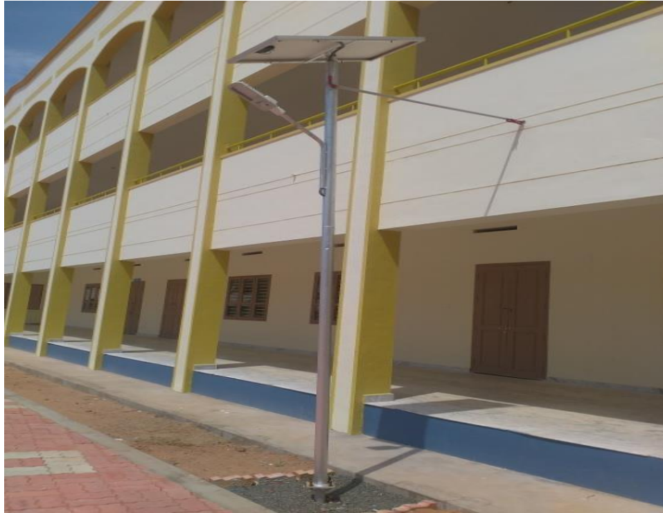
Solar Lighting system